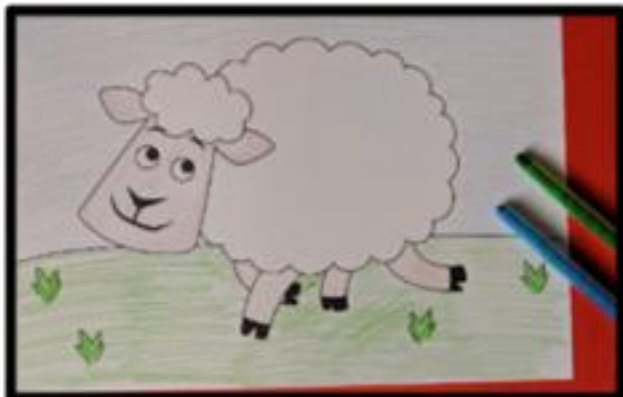
Colour in the page