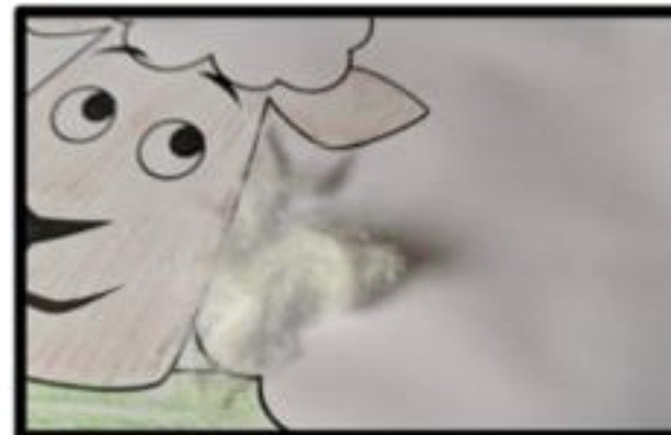
Glue onto sheep