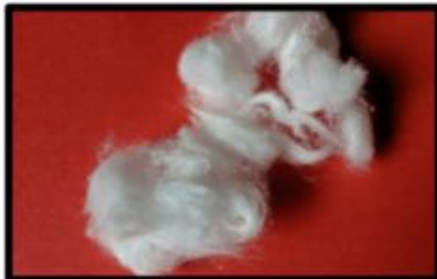
Pull apart the cotton wool